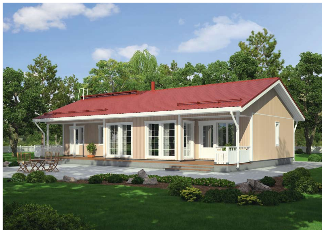
5 h + k | huoneistoala 133 m 2 | kerrosala 150 m 2